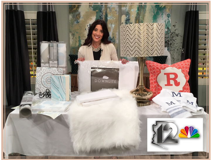
Celebrity Design Tips