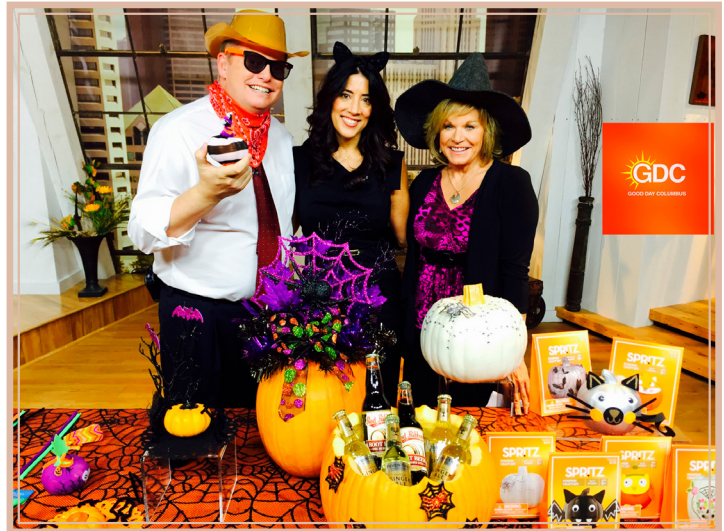
Spooktacular Design Tips