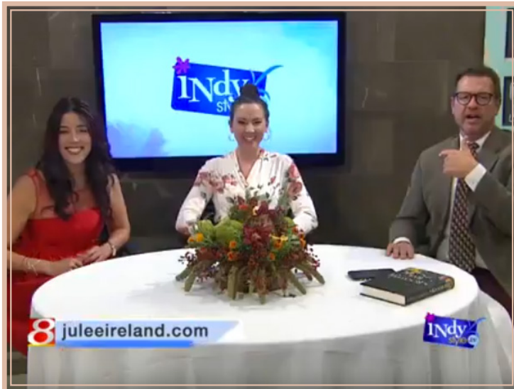
Ask the Design Expert